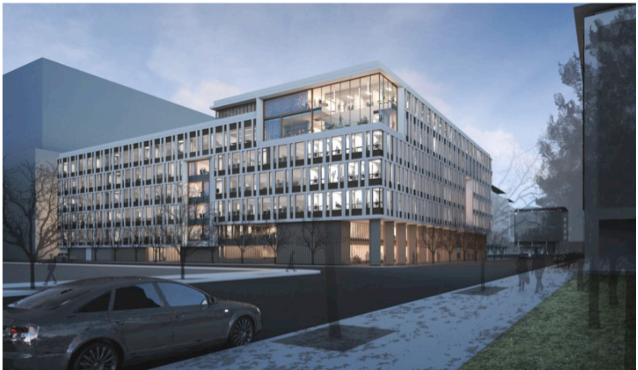
(Mission Hall concept photos) cont'd