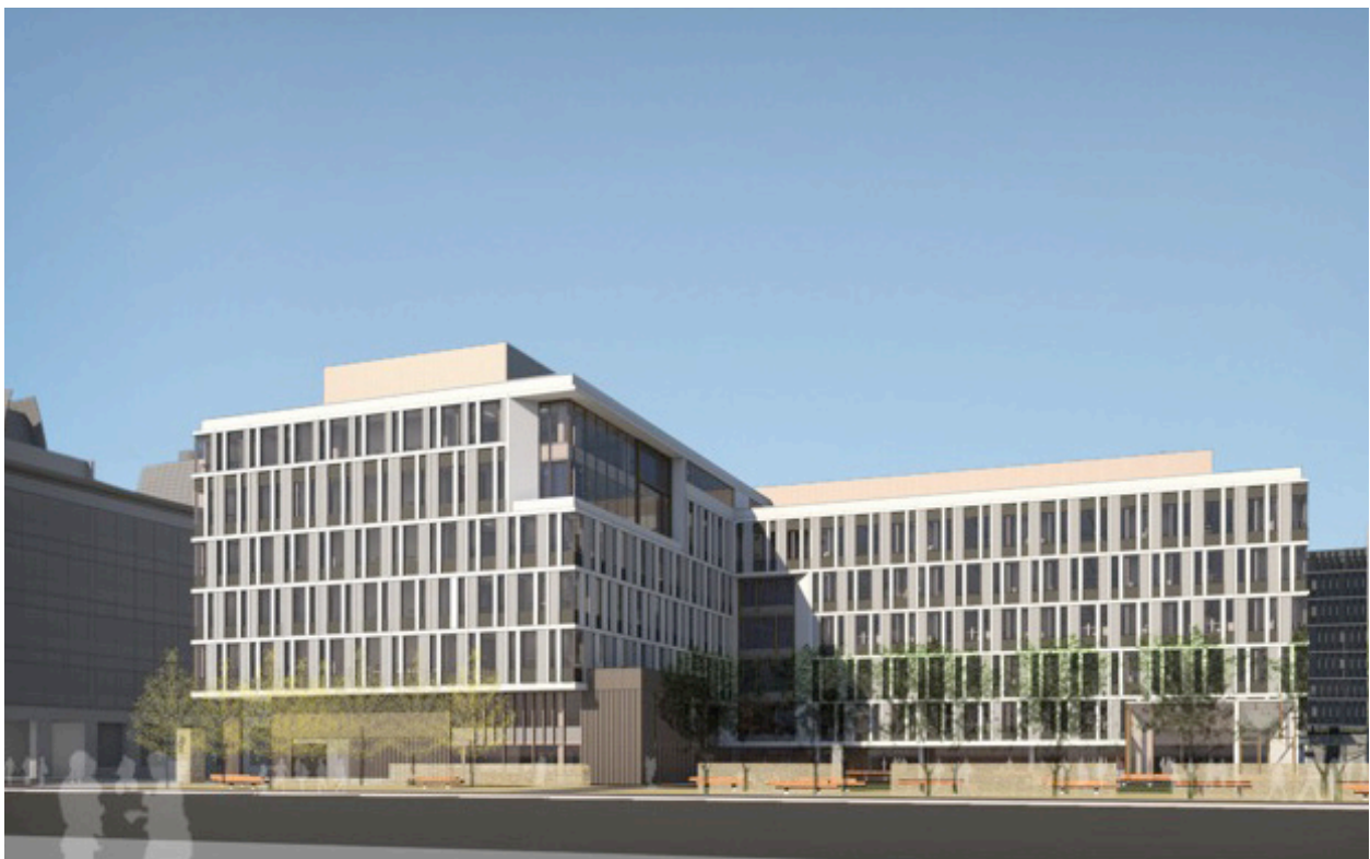
(Mission Hall concept photos)

Love Your Vendor! Partial proceeds from Retail partnerships fund Arts & Events for the UCSF community.