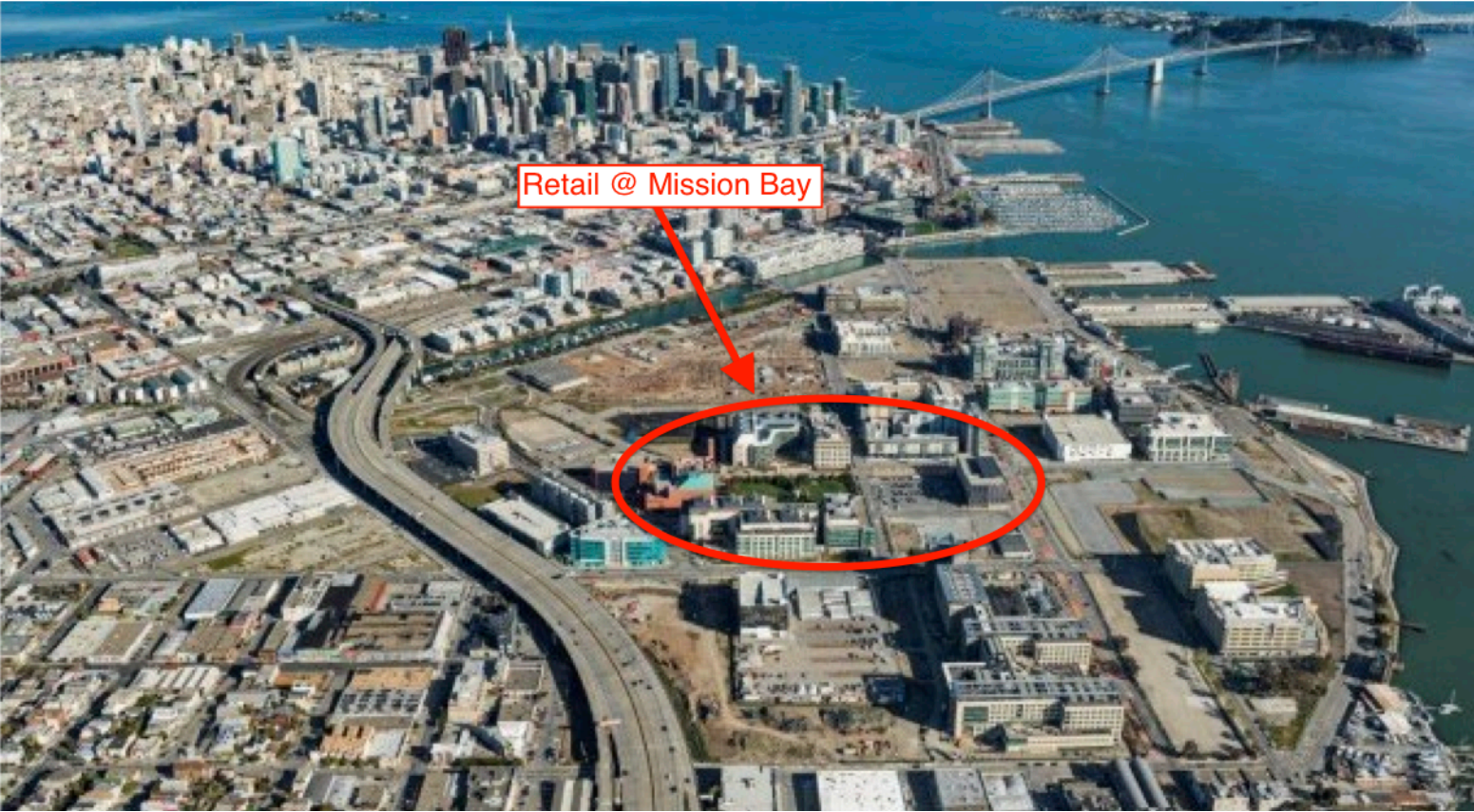
Aerial View of UCSF Mission Bay